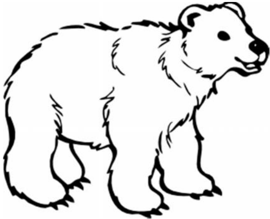
Alabama State Mammal: Black Bear