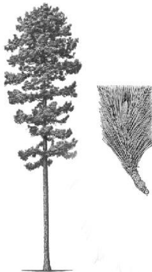
Alabama State Tree: Southern Longleaf Pine