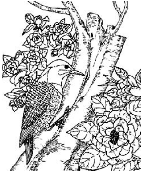
Alabama State Bird: Yellowhammer