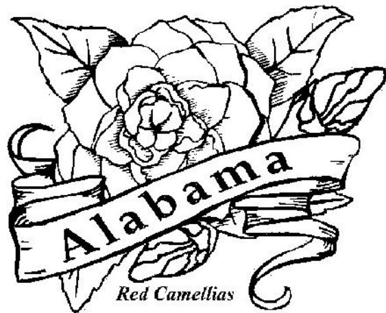
Alabama State Flower: Camellia