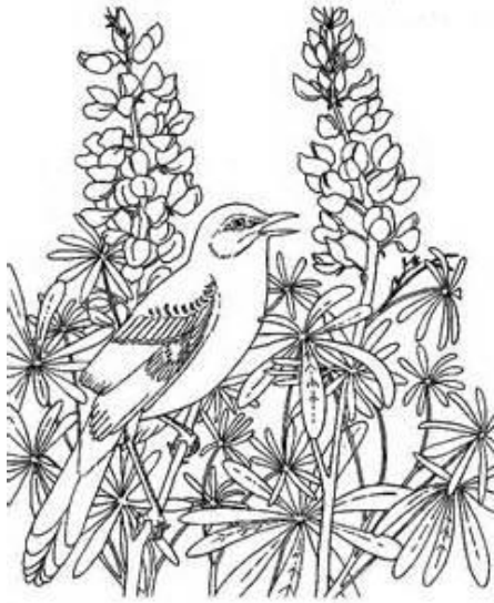
Arkansas State Bird: Mockingbird