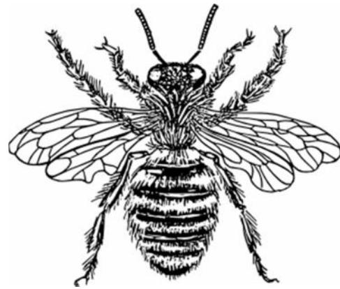
Arkansas State Insect: Honeybee