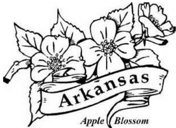
Arkansas State Flower: Apple Blossom