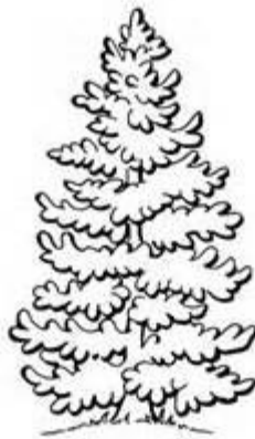
Arkansas State Tree: Pine