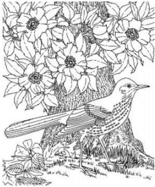
Georgia State Bird: Brown Thrasher