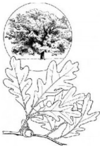
Georgia State Tree: Live Oak