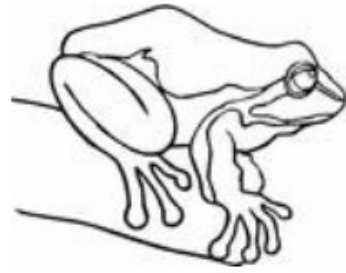
Georgia State Reptile: Green Tree frog